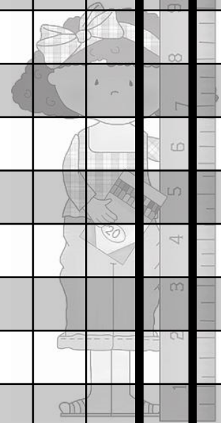
Tableau de conversions